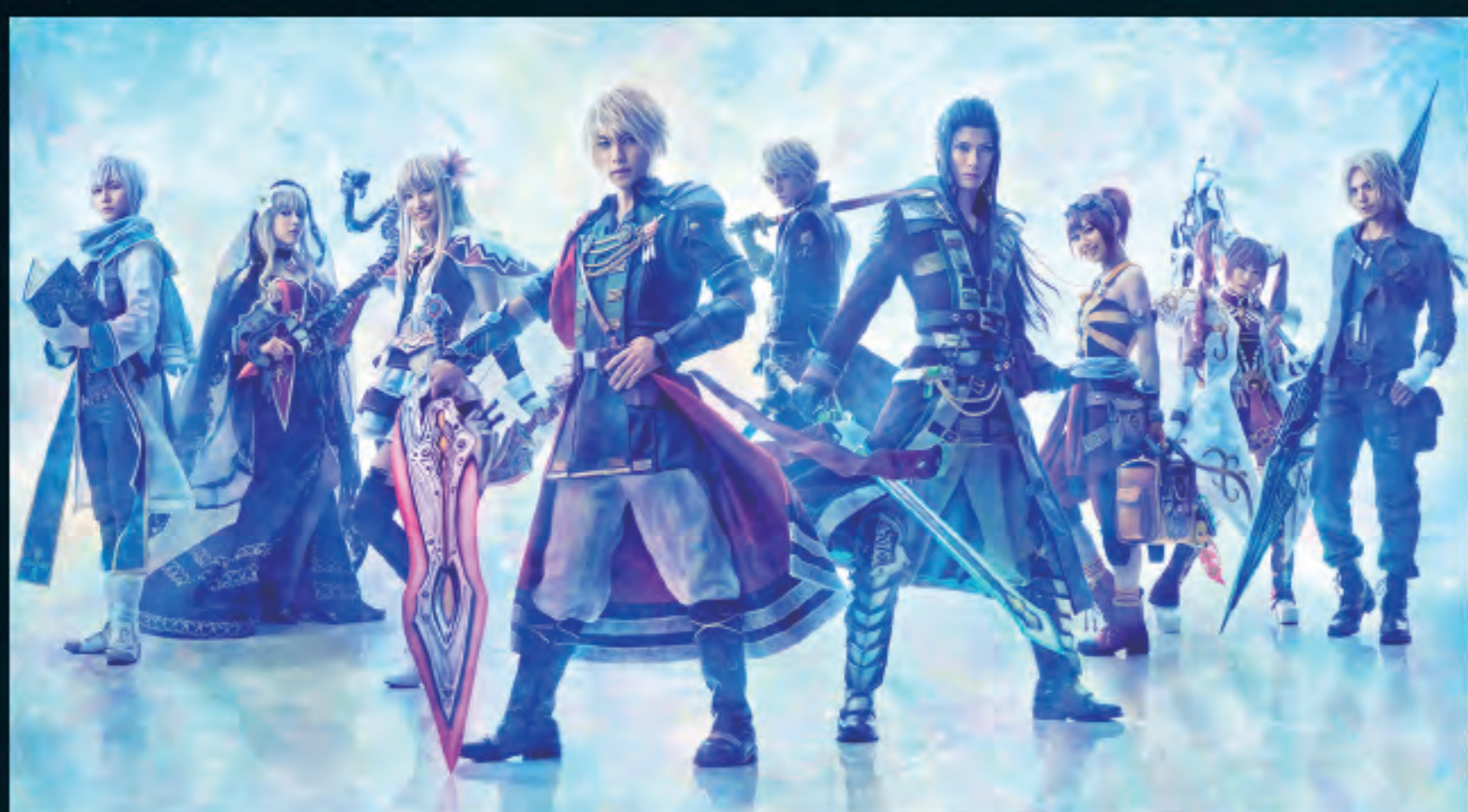
▲ "FINAL FANTASY BRAVE EXVIUS" THE MUSICAL costume exhibition. © SQUARE ENIX © FFBE THE MUSICAL production committee