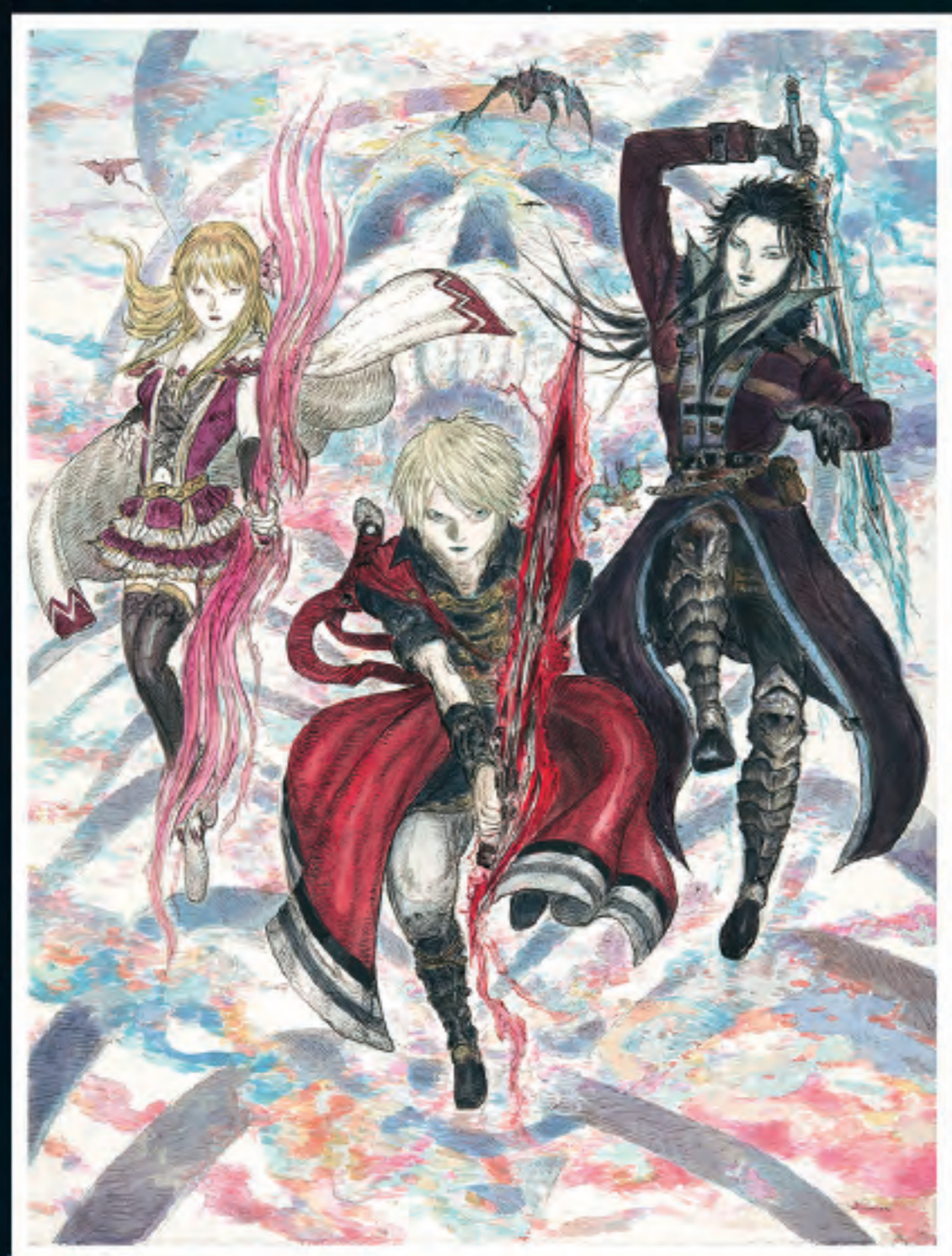
▲ Art exhibition by Yoshitaka Amano. © SQUARE ENIX LOGO & IMAGE ILLUSTRATION: © YOSHITAKA AMANO