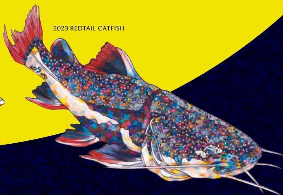
2023 REDTAIL CATFISH