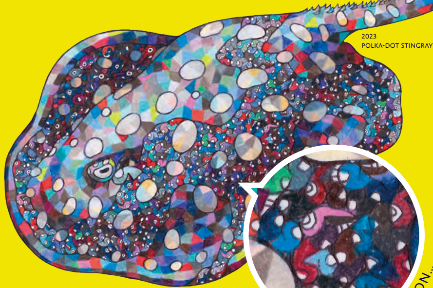
2023 POLKA-DOT STINGRAY

I hope my work will encourage those who see it.