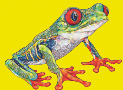
2023 RED-EYED TREE FROG